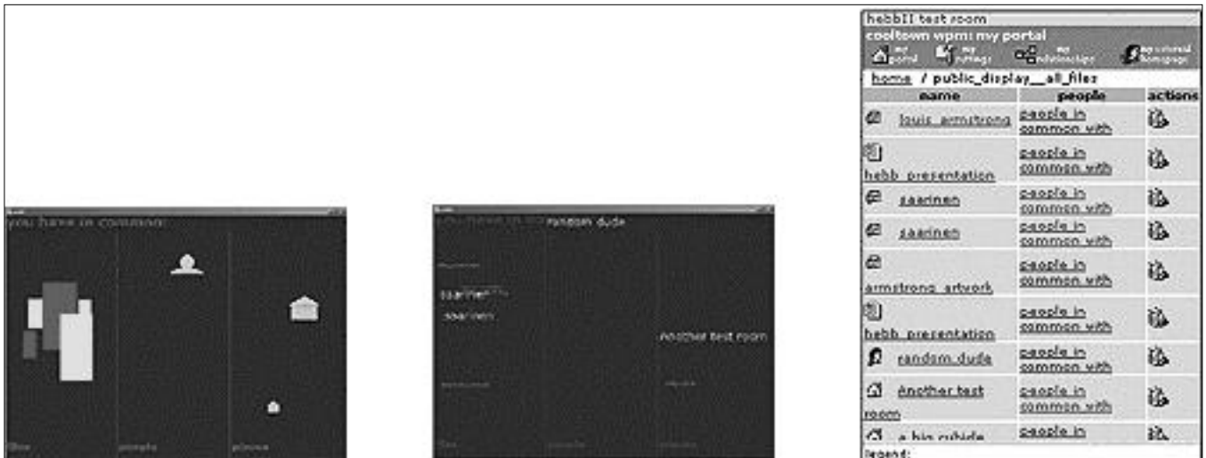
Figure 2. Iconic public display (left), lexical public display (center) and PDA interface (right).

are recorded via the Web Presence Manager infrastructure (WPM) [11].